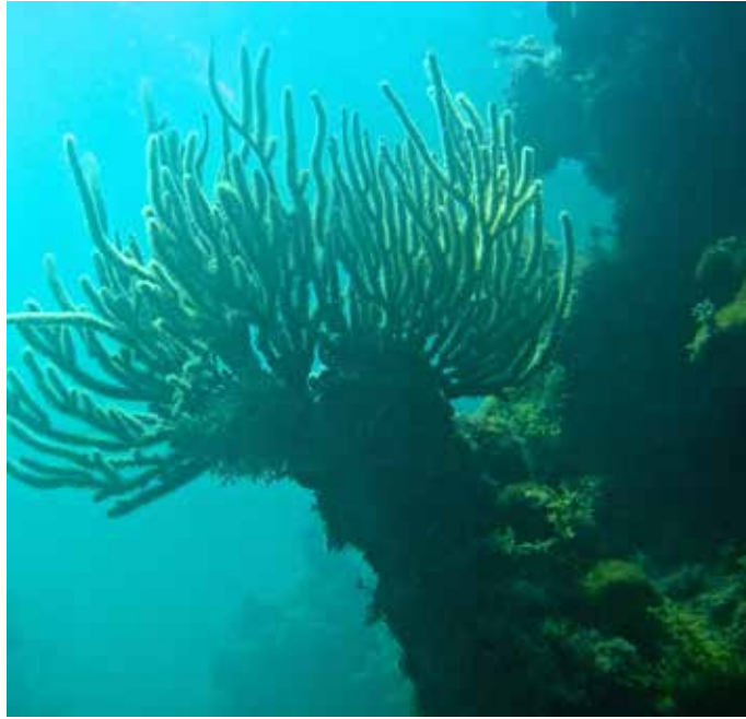
Sea Rod

Stately gorgonian coral or sea rod is an ancient life form that lives in high-energy reef environments. The coral lives in currents that are too strong for most other creatures. The secret is its flexibility which is like that of a willow tree. It allows the sea rod to be tugged through 180 degrees by the surge. The sea rod has traded a life of being constantly battered by waves for the benefits of access to food and less competition for sunlight.