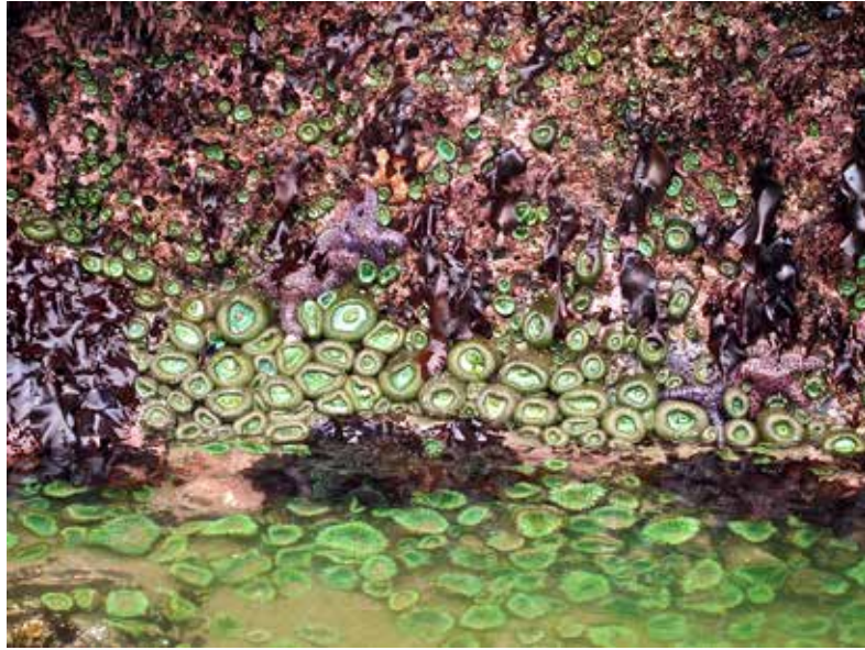
Anthopleura landscape

During spring tides the sea recedes more than normal, exposing parts of the shallow reef to air. At these times we glimpse their hidden beauty and biodiversity. In this image each color represents a different life form: pink coralline algae, green flower sea-anemones, purple starfish and dark seaweeds. Green flower anemones spread by cloning, each one is genetically identical to the other - but even they must make room for other creatures to coexist in this limited space that they call home.