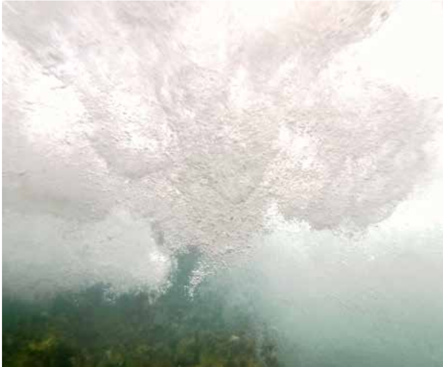
White wave, Courtesy of Dr Deborah Brosnan

Submerged reefs, like rugged city skyscrapers piercing a fluid sky, are the ocean's speed-bumps. Their shape and shallowness slows down water coming from the deep ocean. Robbed of its speed, the water starts piling up until it loses its balance and breaks as a wave on the reef crest.