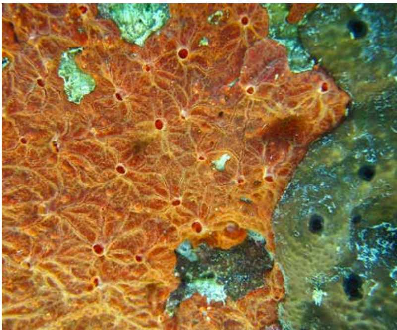
Sponge Standoff

Real estate is often the most highly prized commodity on a reef. Competition for space is high and fierce. When two species meet, there's a standoff. In this image two sponge species, one orange and one green, have encountered each other and are fighting to establish their boundary line.