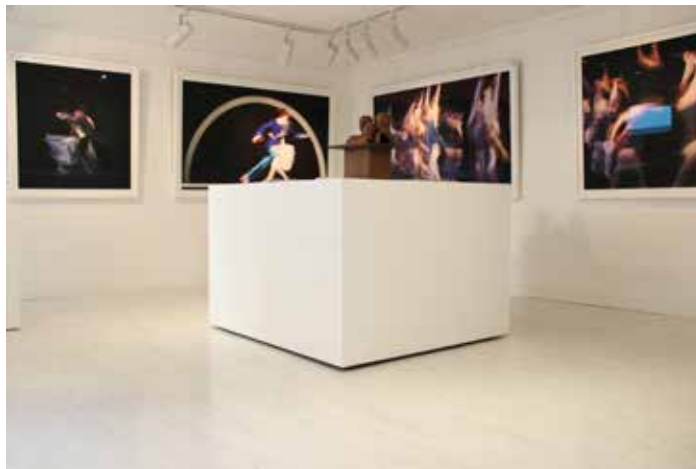
Installation shot - Mikhail Baryshnikov at Space SBH, December 2013